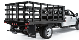
Hauler & Platform Bodies