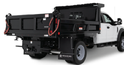
Dump & Landscape Bodies