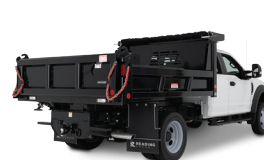
Dump & Landscape Bodies