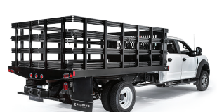
Hauler & Platform Bodies