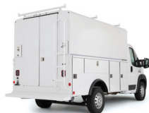
Enclosed Service Bodies