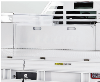
Tailboard position 1

Customize your cargo space with a movable tailboard that can create one large storage area or two smaller ones.